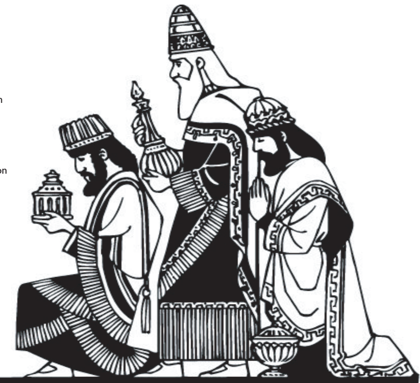
We have come to Homage Him.