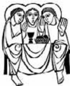
The Holy Trinity, Year B. Illustration © 2000 S.Erspamer.

Text, Philip J. Sandstrom, STD © 2000, OCP. All rights reserved.