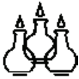
Mass of Chrism

Tuesday, April 3 rd -6pm-7:15pm Please join us and bring a friend